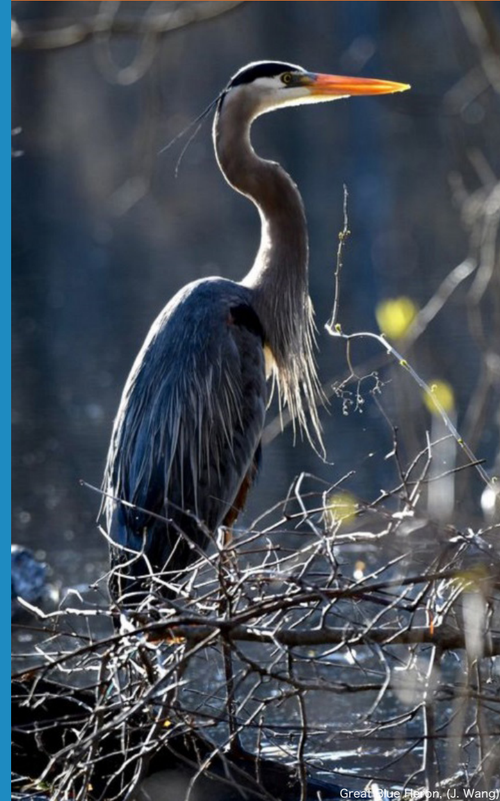
Great Blue Heron, (J. Wang)

Scan here to access the digital guide and view the virtual tour of the trail.