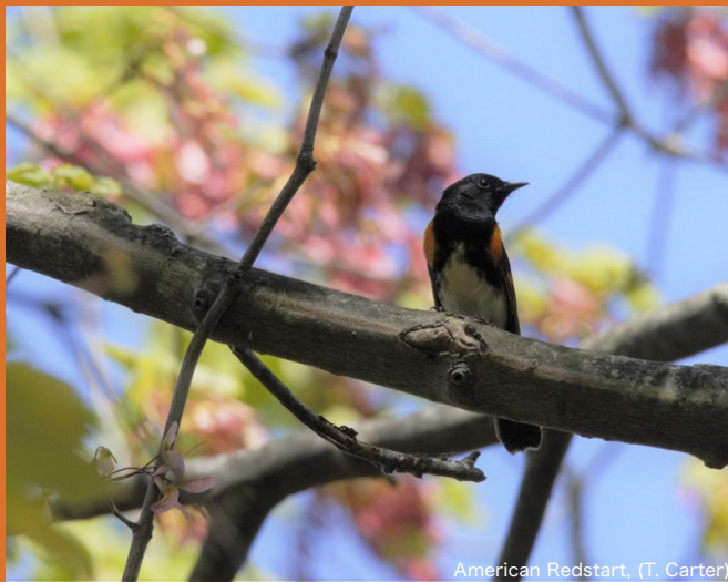
American Redstart