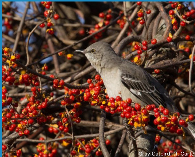
Gray Catbird